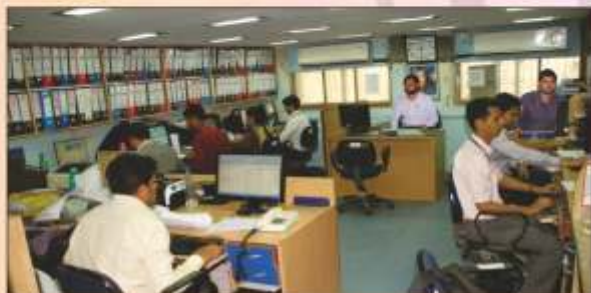
Accounts & Finance Department