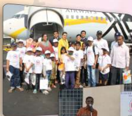
Jet Airways flight for Cancer Patients

Also in various occasions CARF had distributed ration and fruits.