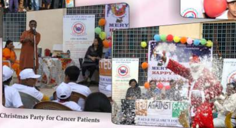
Christmas Party for Cancer Patients