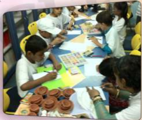
Cancer Patients made diyas for Diwali

Through CRC we will provide training to cancer patients & their relatives by making paper bags, Candles, Craft items, Tailoring etc as per their skills. We will pay them on day to day basis. This will help them to a great extent to meet their day to day expenses. Besides training we will arrange job for them outside CARF by using our contacts & tie-up with different placement agencies. We will not leave any stone unturned to make the life better of cancer patients & in our UNITED FIGHT AGAINST CANCER.