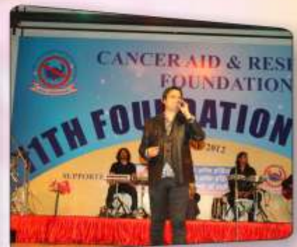
Comedy King Raju Srivastav and his musical team entertained Audience.