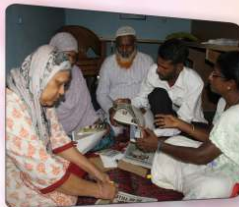
Cancer Patient relatives made bags with news paper