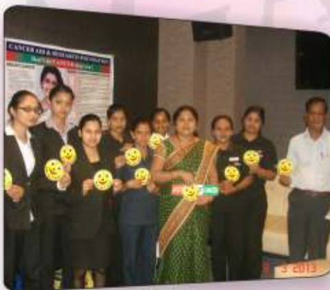
Grant Home Tale, Malad.

CARF also use its Website and Social Media (as Face Book, Twitter etc) to spread Cancer Awareness and educate people about CANCER.