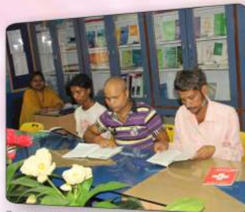
Cancer Patient relative read books on Cancer