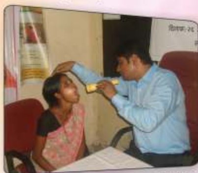
Medical Camp at Village Karavali, Dahanu.

In our fight against cancer we make the young generation aware about the ill effects of Tobacco and Gutkha. Now a days is many of the state Governments have banned Gutkha and cigarette in their states, which the most common substance for causing cancer. Thus it's our moral responsibility to make people aware and for this purpose we CARF continuously do screening of cancer awareness films free of cost in schools, colleges, corporates, Government Organizations etc. (as prevention is better than cure). This year we have done screening camps in the big institutions like Big Bazar, St. Andrews College, SBI, Women Welfare Association, Grand Sarover Premier Groups, Muslim Ambulance Society, Anjuman-Islam, Rashtriya Hit Party.