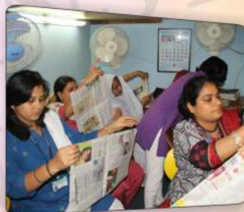
Bag Making in CARF Office