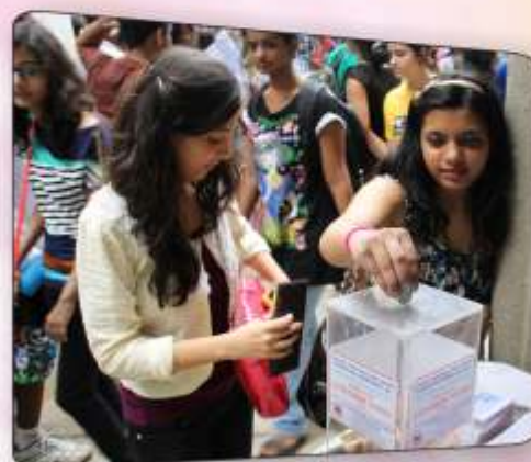
MALHAR (Annual Festival of ST Xaviers College)