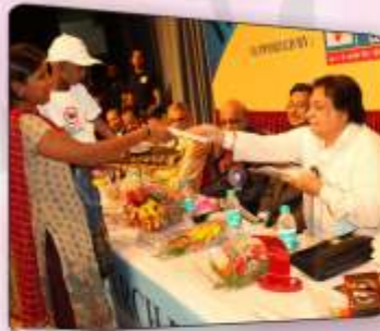
Medical Help cheques handover to Cancer Patients by Famous Actor Kadar Khan