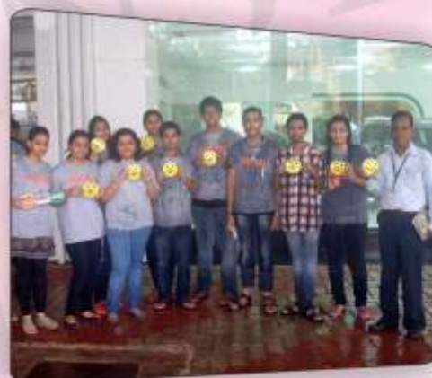
CARF DRIVE at Breach Candy