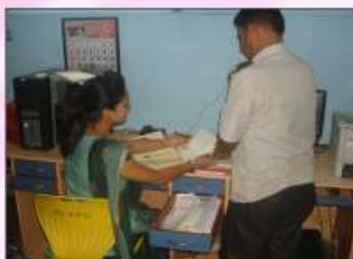
Fund Raising Department