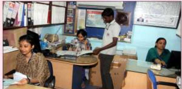
Patient Services Department