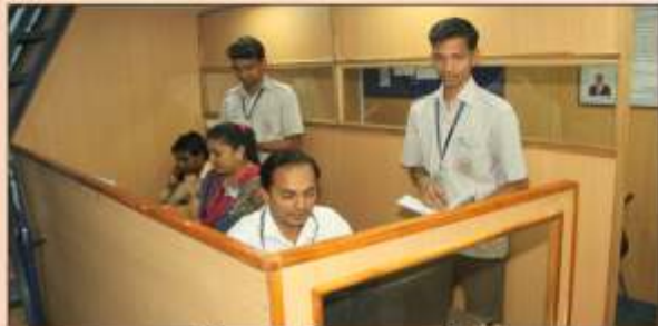
Human Resource & Administration Department