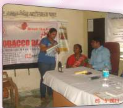
Medical Camp at Village Karavali, Dahanu.