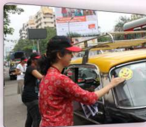
CARF DRIVE at Byculla