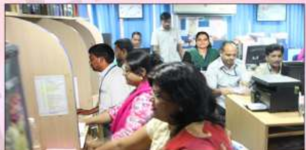
Publication & Publicity Department