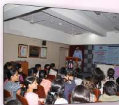
Thakur College Screening